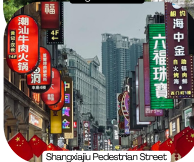
Shangxiajiu Pedestrian Street