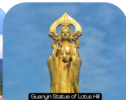
Guanyin Statue of Lotus Hill